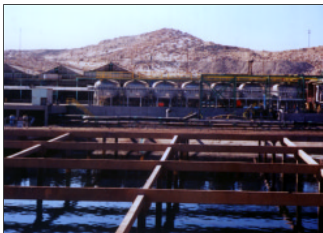
With systems in Peru, Chile, Mexico, Australia, Canada, and the United States, Smith & Loveless is the industry leader in SX electrolyte filter installations.