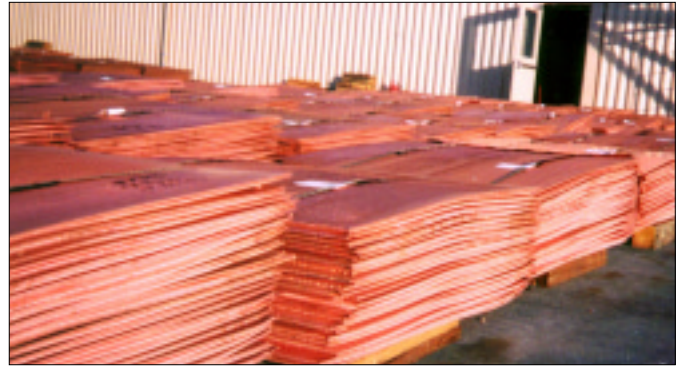
The Smith & Loveless DI-SEP® SX Electrolyte Filter removes 95-99% of organic material, which aids in producing extremely high quality copper.

Good SX practice (not overrunning cycle times, not flowing too fast, keeping in good mechanical order) along with good tankhouse, will work together to produce superior quality copper.